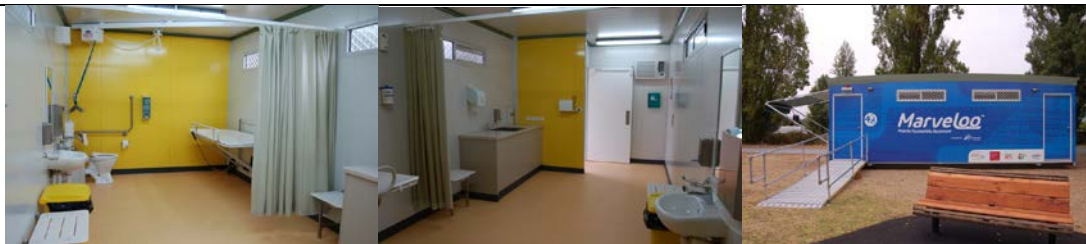
Figure 7 The only fully Accessible Temporary ‘Changing Places’ toilet in Australia. Marveloo by Maroondah City Council VIC.

A Fully Accessible Temporary Toilet would be the “Changing Places” style of toilet which includes change table and hoist. The Design is shown in Figure 7; currently there are no toilets of this classification type in WA.