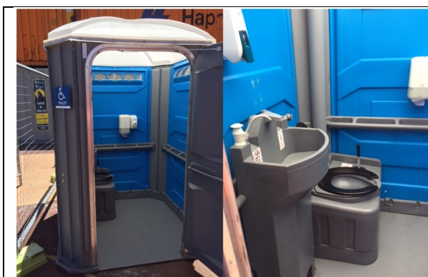
Figure 1 WA accessible temporary toilet Style A (Photo DOH Dec 2016)