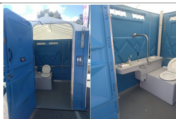
Figure 2 WA accessible temporary toilet Style B

The 2012 Census found that disability affects just under one in five people in Australia. People who identified having specific limitations or restrictions were found to make up 16.3% of the total Australian population (Australian Bureau of Statistics, 2013). This could mean that up to 16% of any population attending a site with temporary toilets could require accessible temporary toilets rather than standard temporary toilets.